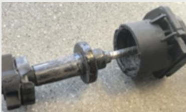
BROKEN HUB ON SELECT COPY CABLE