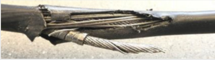
BROKEN CABLE ON SHIFT COPY CABLE