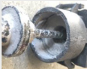
BROKEN HUB ON SELECT COPY CABLE